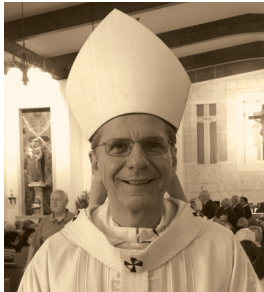
Most Reverend Gustavo García-Siller, MSpS Archbishop of San Antonio

Our parish target for On the Way - ¡Ándale! is $2,424,000 of which we will receive back 30% or $727,200 .