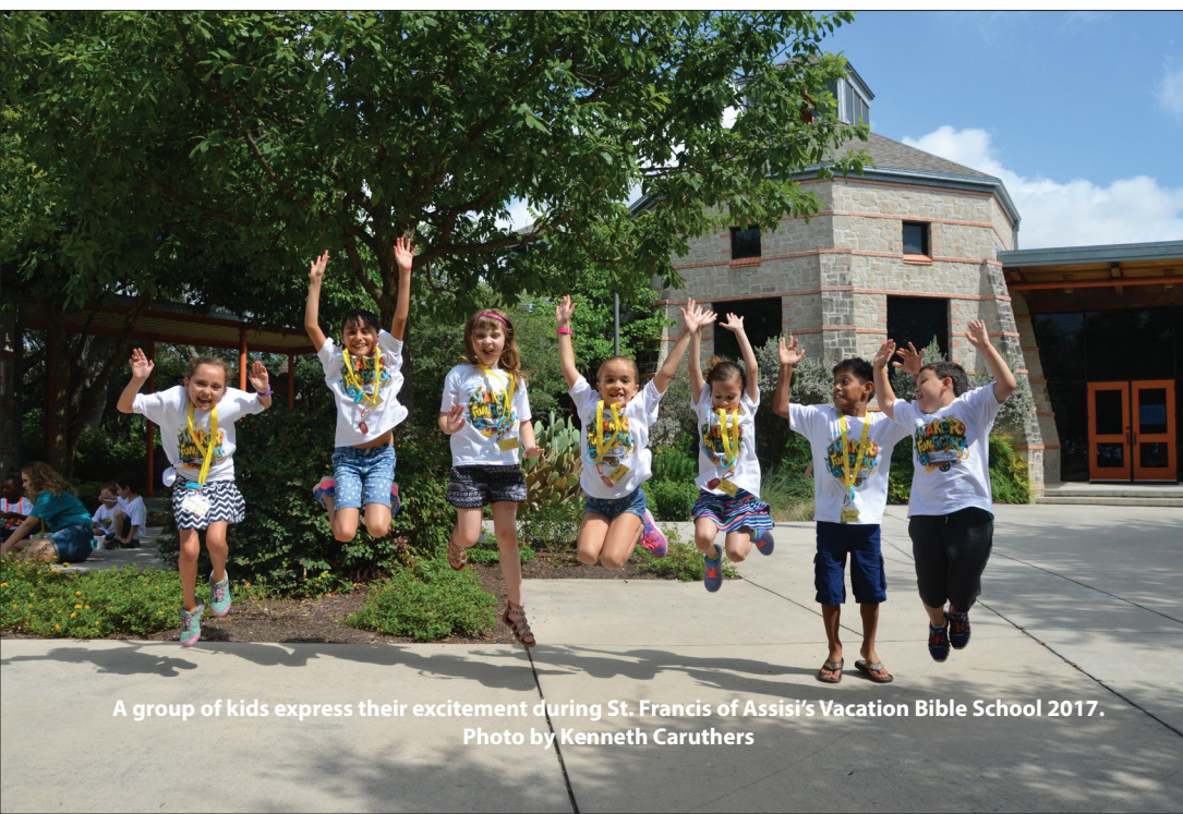
A group of kids express their excitement during St. Francis of Assisi's Vacation Bible School 2017.