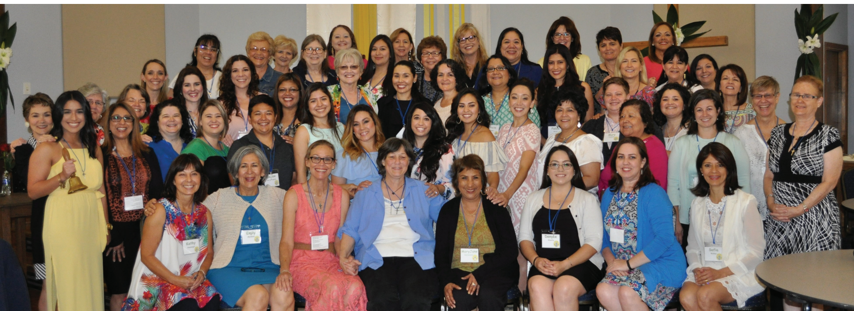
Top: Our Men's ACTS retreat from May 30-June 2, 1996. Bottom: Our Women's ACTS retreat from April 20-23, 2017.

Knowing our parish, we know that there will be wonderful stories told that will bring the ACTS history at St. Francis to life! We also know that the Holy Spirit will continue to inspire our celebration with ideas for our year-long observance—opportunities to grow in Adoration, Community, Theology, and Service!