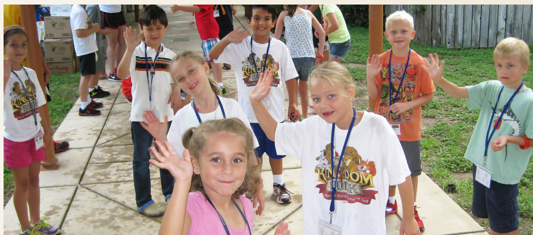
Children participate in outdoor activities at Vacation Bible School 2013.