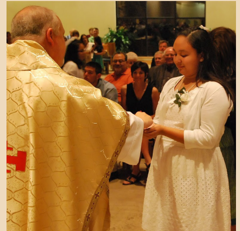
Young ladies receive the Eucharist for the first time.