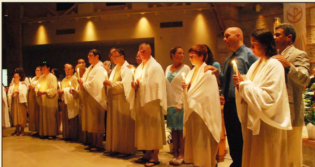
Newly baptized and confirmed stand with their sponsors at the Easter Vigil 2013.

Help one another: this is what Jesus teaches us and this what I am doing, and doing with all my heart, because it is my duty. As a priest and a bishop, I must be