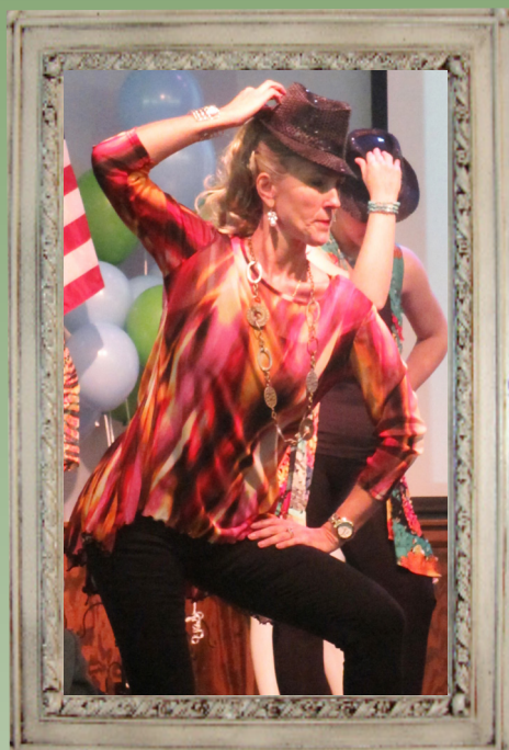
Choreography is incorporated in the show.