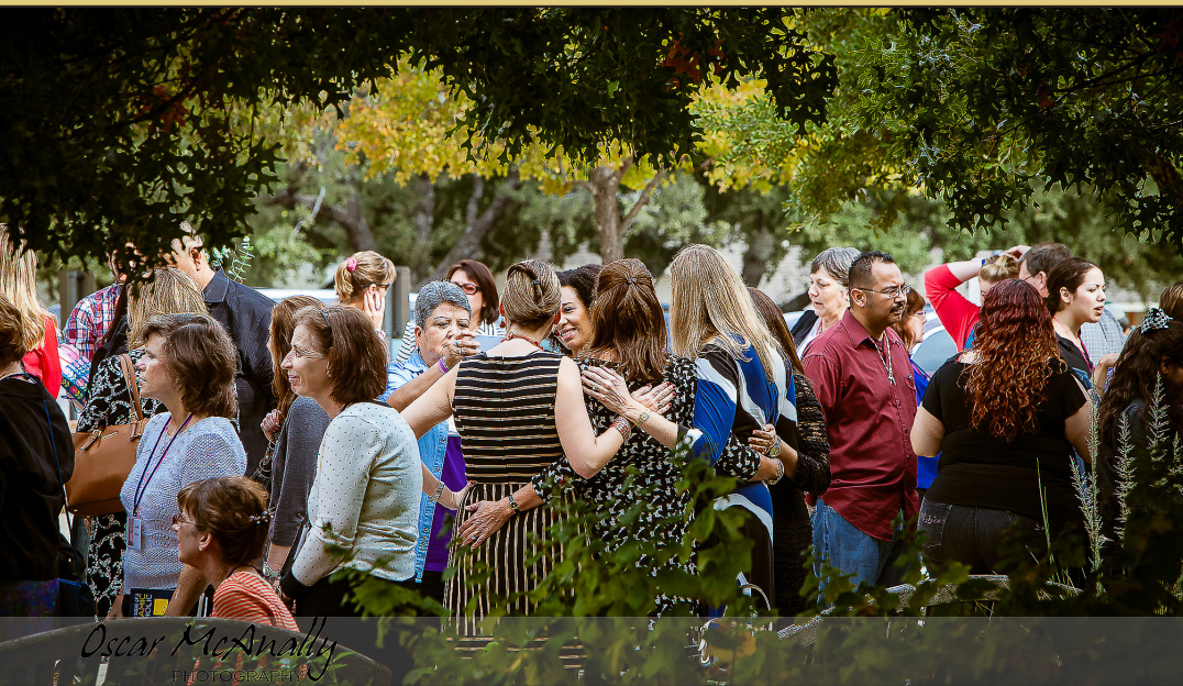
Parishioners gather outside after Sunday Mass.

Your Official News Source for St. Francis of Assisi Catholic Church, San Antonio, Texas