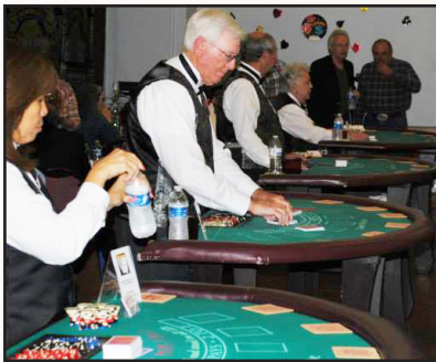
Dealers prepare gaming cards.