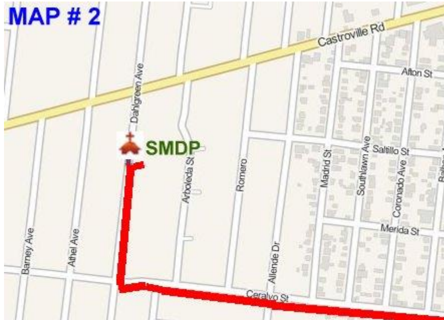
MAP # 2